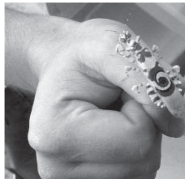
Despite the drizzle, the Sixth Annual Insect Festival was a hit with all ages. From left to right: - Friendly hedgehog from the Children's Zoo - Floral mantis, from Krazy 8's Invertebrates