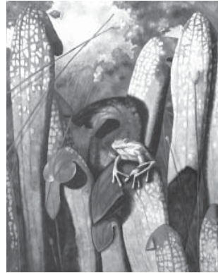
Lunch on the Fly - by Julia Gray

This unique event is a combination of wetland-themed art works and a carnivorous plant experience, featuring mini garden environments, or bogs . Through art, science, lectures and displays, the community can discover the animal and plant species of wetland habitats, locally and around the world, with a special emphasis on the many amazing species of carnivorous plants and amphibians.