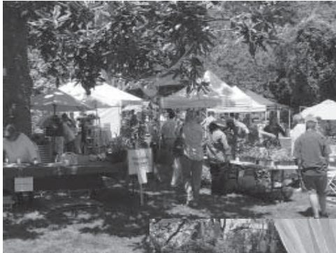
Beautiful day for the Herb Festival.