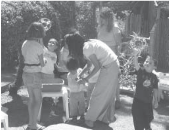
Bubble play is always a popular pastime.

Among the many prestigious chocolatiers on hand were Chuao, Chi Chocolat, Guanni Chocolate and Rocky Mountain Chocolate Factory, as well as gift and garden art booths. Chocolate was not the only food on hand: Big Jim's Barbeque and Oggis Pizza also pleased crowds.