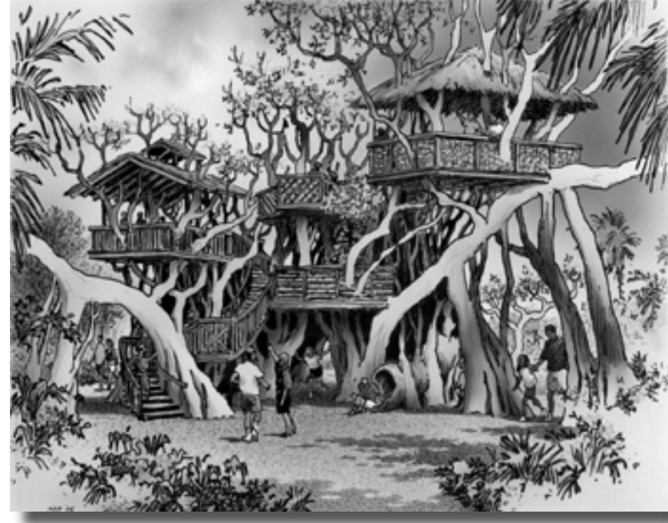
Artist's rendering of Banyan Treehouse for Wild Encinitas.

Both renderings are courtesy of James D. Burnett, FASLA, Solana Beach. Larger drawings can be viewed at Quail Botanical Gardens.