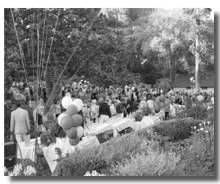
The Rotary Wine Tasting Fundraiser last year was a sell out. Get your tickets in advance.

Aug. 7 Ladies Sing the Blues Aug. 21 The Bayou Brothers