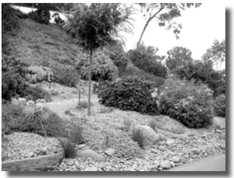
Firescape garden improvements include a dry stream.

Next time you're in the Gardens, take a stroll over to the Ecke Building area and see the improvements and ideas in the Firescape Garden.